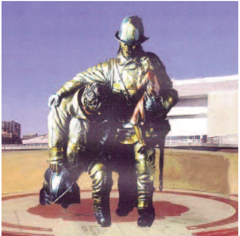
Firefighters' Memorial – 12-Ft. High – Bronze Sculpture